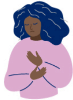
CHEST OR THROAT PAIN